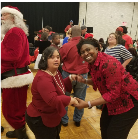
Santa, clients and staff enjoying our annual Christmas Party

As dusk began to fill the skies, dessert was served, and the dancing wound down. Clients were then transported to their homes, tired but happy from the big event.