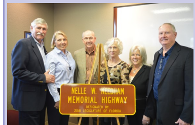
The Needham Family