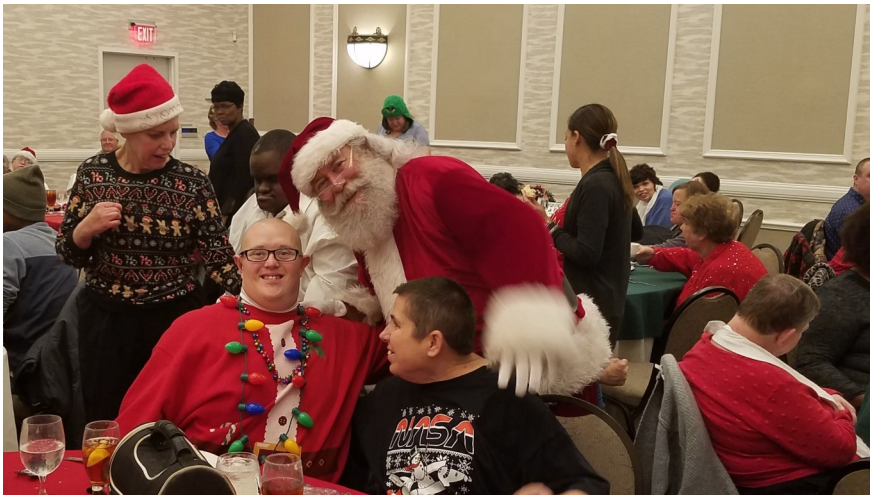
Santa is making his rounds