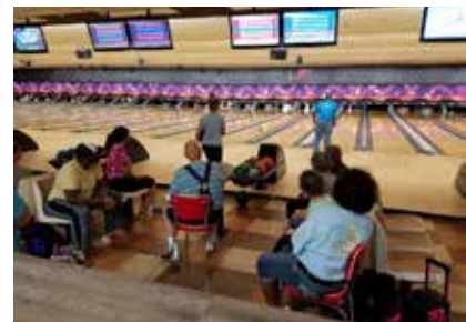
Clients and staff attending ARC bowling night