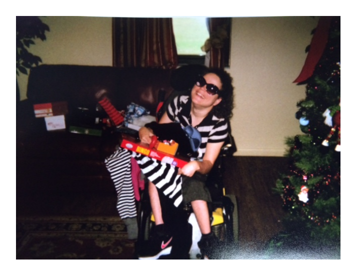
Many thanks to Ocala Regional Medical Center for bringing gifts to the children in our EIP Program. They certainly brought joy to the season!