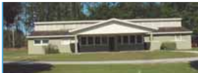
Before and After of Group Home One Located on ARC's campus