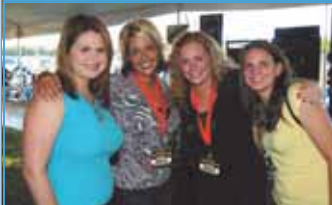
The ladies of WIND FM, Entertainment Sponsor

THANK YOU to all who participated in our events and who purchased chance drawing tickets. Be watching the Web site: www.HogforHope.com for details about next year’s events!