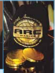
Celebrating 50 years