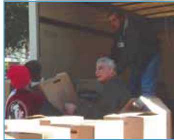
Loading the truck.