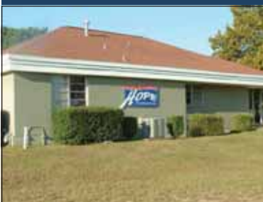
Nelle Needham Administration Building