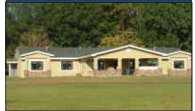
Group Home 2